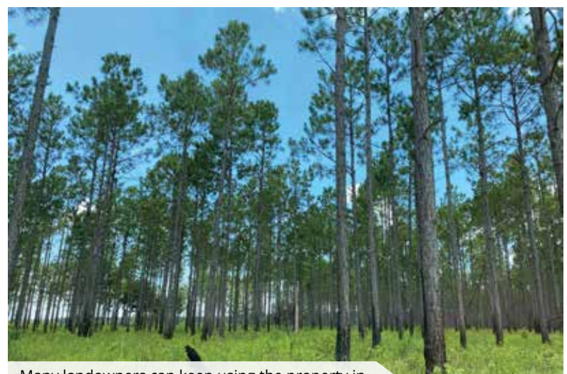
Many landowners can keep using the property in the same way as before the easement while relinquishing certain development rights.

The Act also provides "safe harbor" easement language to further increase donor confidence and fairness in the program. By providing safe harbor language, a donor has increased assurance that a conservation easement's terms meet federal