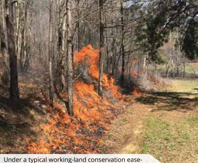
ment, a landowner can continue to engage in best management practices, such as prescribed burning.

Claimed Deduction Relative to Basis: The first provision of the Act disallows a charitable deduction by a partnership (including pass-through entities) if the deduction claimed exceeds 2.5 times the sum of each partner's relevant basis. Two exceptions exist. First, the 2.5 times basis ratio does not apply to property owned for more than three years. The relevant date for calculating the period of ownership is the latter of the following: (a) the last date on which the partnership acquired any portion of the real property; or (b) the last date on which