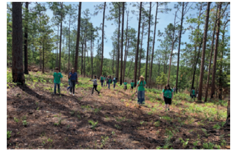
Scavenger Hunt at Sugar Hill

At the farm, school representatives divide the children into smaller groups. Each group rotates through different activities involving nature, wildlife, and farm life. For instance, one group might participate in wildlife scavenger hunt looking for animal skulls, antlers, feathers, turtle shells, and other hidden objects, while another group might observe a quail dog demonstration.