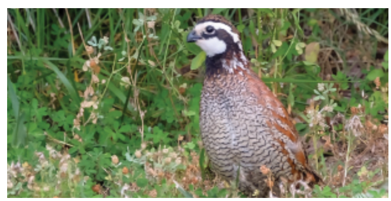
Quail