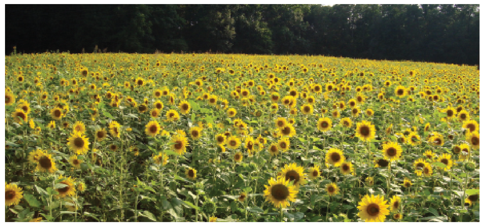
Rising Fawn Gardens Sunflower Field

Many landowners who made the commitment to permanently protect land also wish to share the beauty of that land with others: family, friends, and co-workers; clubs, such as Cancer Navigators or Cub Scouts; caving groups and others. Here are some stories of our landowners sharing their conservation.